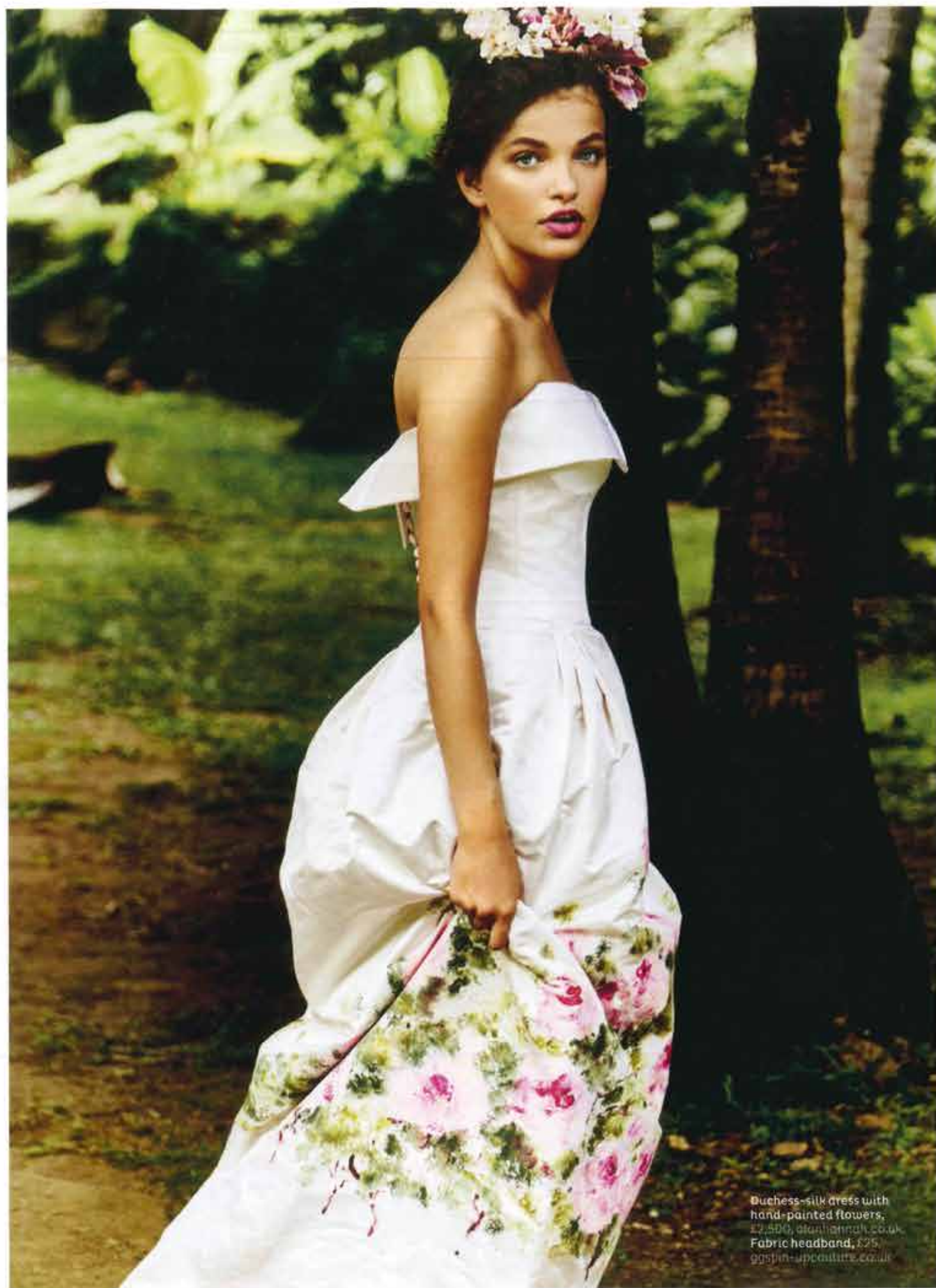
Duchess-silk dress with hand-painted flowers, £2,500, alanhannah.co.uk . Fabric headband, £25, ggstijn-upcoastlife.co.uk