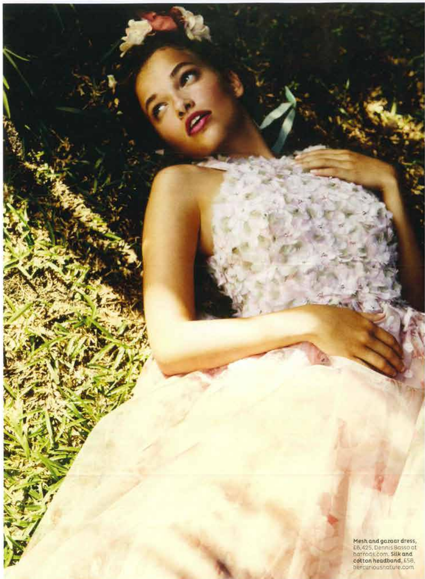
Mesh and gazar dress, £6,425, Dennis Basso at barrods.com . Silk and cotton headband, £58, hercuriousnature.com .